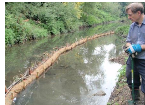
BEFORE - Creating the low level berm to narrow the river and create new marshy areas;