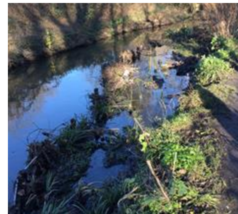
AFTER - marshland plants have colonised the area and the narrowed river is cleaner and faster

Thames21, London Borough of Lewisham, Environment Agency.