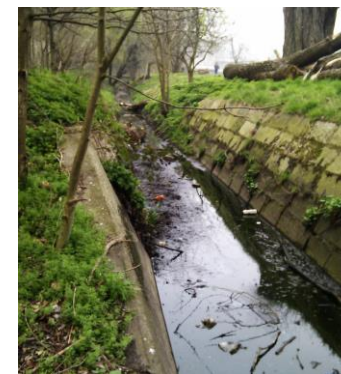
BEFORE – The River Moselle before restoration works.