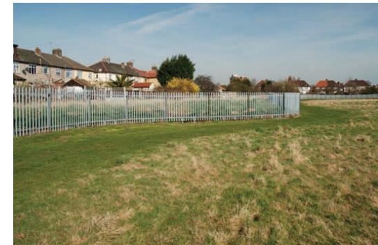
BEFORE – Metal fencing blocked access to the river – marginalising it to the side of the park