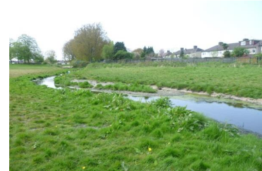
AFTER – The river is given new life as it meanders proudly through the Mayesbrook Park grassland

London Borough of Barking & Dagenham, Environment Agency, Natural England, Thames Rivers Restoration Trust, Greater London Authority, Olympic Development Association, Thames Water.