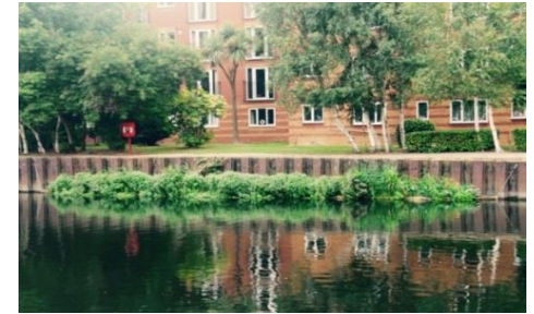
AFTER – a completed reedbed smartens up the river’s appearance and provides vital habitat for wildlife

Thames 21, Environment Agency, Canal and River Trust, Lea Valley Regional Park