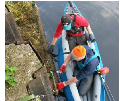
BEFORE – Thames21 volunteers help install the reedbed