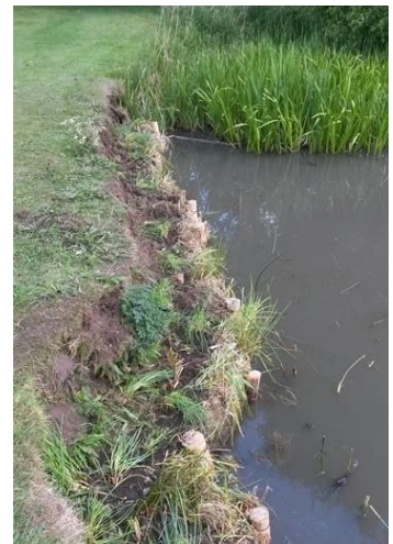
Example of marginal planting