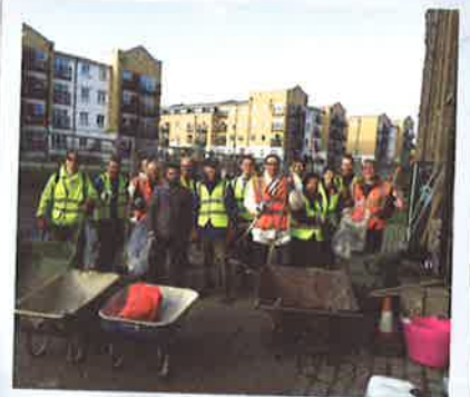
Trainees who have completed the course, leading their own cleanup event