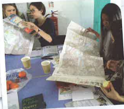
Trainees at Day 1 of Leading a Waterway Cleanup

Plan and run a safe, effective and fun event