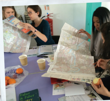
Trainees at Day 1 of Leading Action for Healthy Rivers

Plan and run a safe, effective and fun event