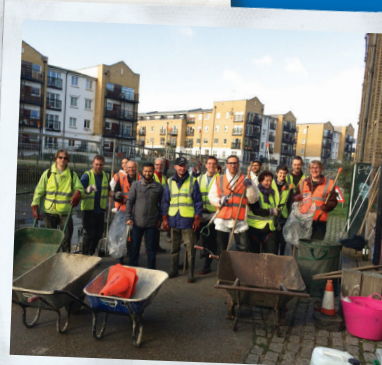
Trainees who have completed the course, leading their own cleanup event